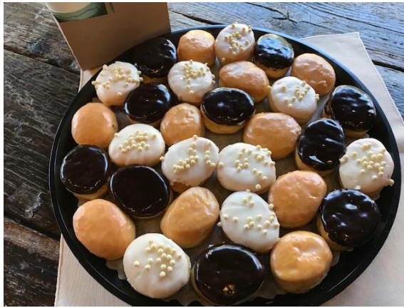
“Classic” Party Tray

Deluxe Party Tray - $70 – “Not-So-Mini” Minis. Rotating seasonal flavors and/or custom decorating, ask us. Customer chooses up to 3 flavors.